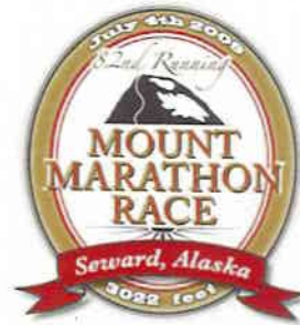
Race Logo Designed By Robert Flood